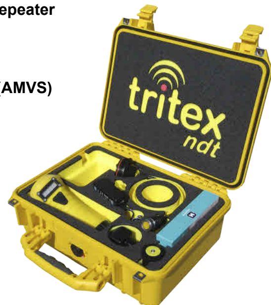
Multigauge 3000 Standard Kit