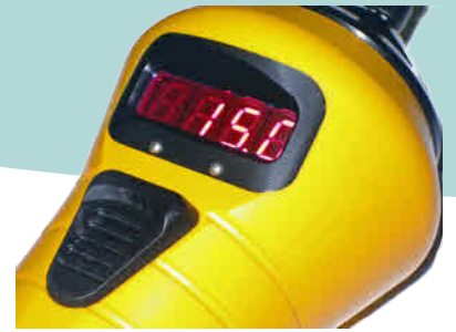
Large Bright 10 mm Display