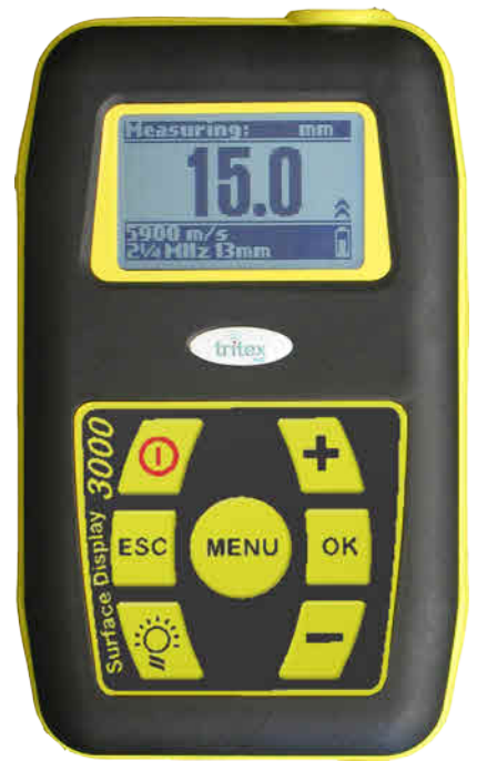
Surface Display Unit

The MultigaUGE 3000 can be easily upgraded to one of two topside repeater options by simply replacing the end cap. An alternative end cap houses an Impulse connector for connection to an umbilical. The umbilical can be up to 1000 metres long.